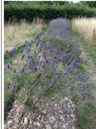
A lovely row of Lavender