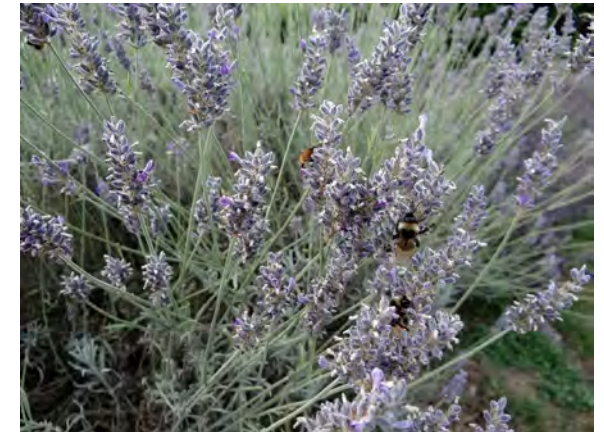
Lavender is for Bumble and Honey Bees as well as Butterflies