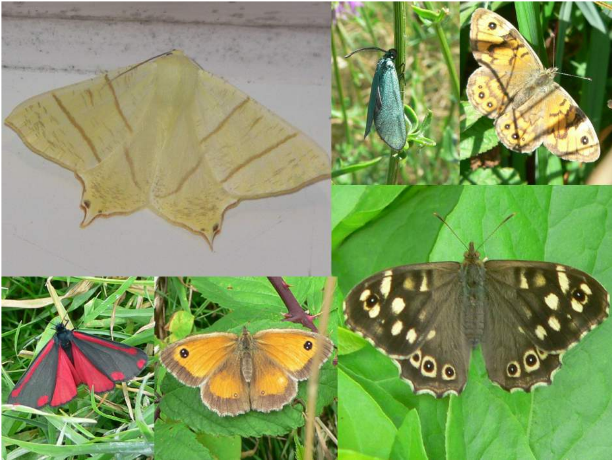
left to right ; top to bottom

Swallow-tailed Moth : Diurnal (Daytime) Forester Moth : Wall Brown Cinnabar Moth : Gatekeeper : Speckled Wood